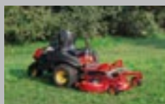
TURBO Z 23 hp