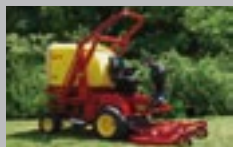
PG - SR 22-28 hp