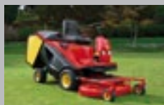
GTR 16-20 hp