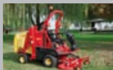
GT 28 hp