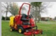
GTS 20-22 hp