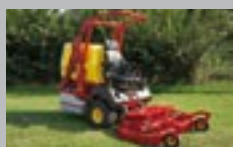
TURBOGRASS 22-23 hp