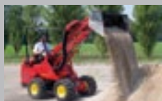
TURBOLOADER 22-36 hp