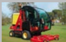
TURBO 1-1W-2-4 28-44 hp