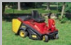
GTM - GSM 15,5-16 hp